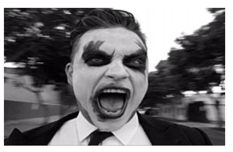
Assessing Daytona 500 championship with Data Visualization (Yellowfin Business Intelligence)