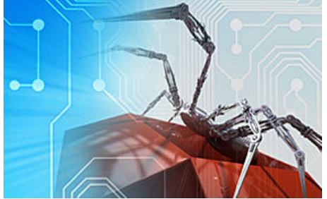
How Enterprises Can Break the Cyber-Attack Lifecycle (eWeek)

(http://www.eweek.com/security/slideshows/how-enterprises-can-break-