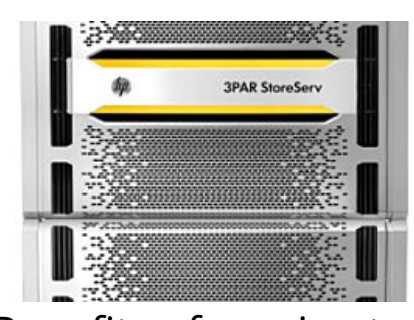
Benefits of moving to All Flash Data Center (HP Blogs - The HP Blog Hub - The HP Blog Hub)

(http://h30507.www3.hp.com/t5/Storage-Insider some-summertime-storage-reflections/ba-